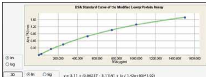
Figure 3. The BSA standard curve of the Modified Lowry Protein Assay generated with the Quantitative Curve Fit calculation step of the SkanIt Software. The four-parameter logistic was used as the curve fitting type.