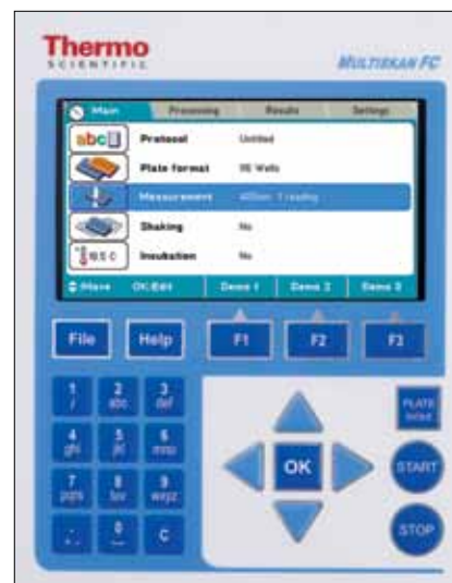
Large color screen and visual internal software

Applications: Immunoassays (ELISA), protein assays, endotoxins, cytotoxicity and proliferation assays, enzyme assays, growth curves