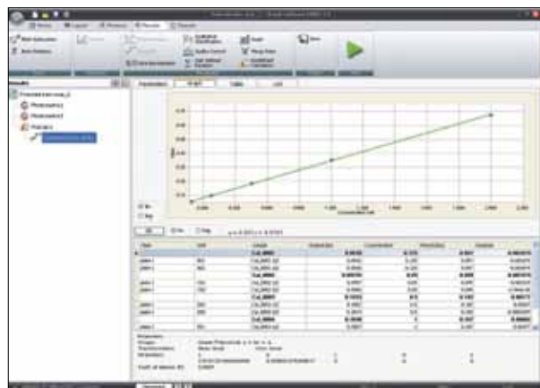
Visual and logical user interface of SkanIt Software

Built using the highest quality components, Multiskan FC conforms to the RoHS (Restriction of Hazardous Substances) directives.